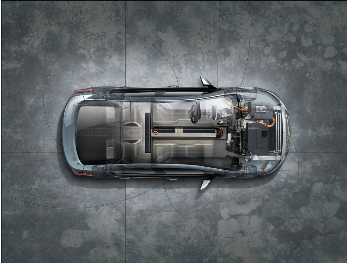
Figure B-1. Overview of the GM Volt