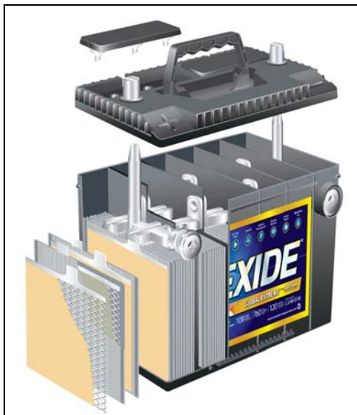
Figure 2. The Lead-Acid Battery Showing Internal Components